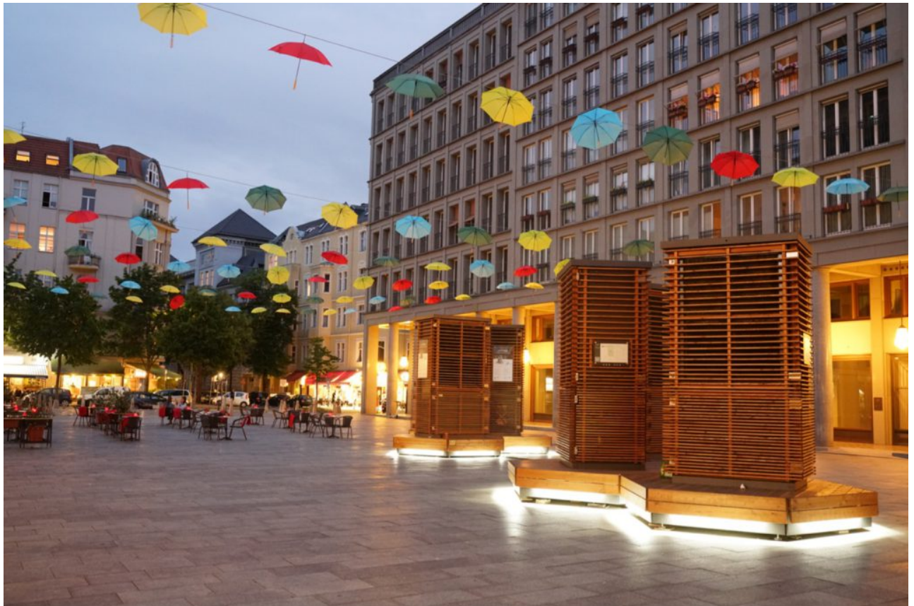
Green City Solutions Berlin

Independent field studies have shown that up to 82 percent of the fine dust in city air can be filtered directly by the City Trees, which the company has installed in cities across Germany, and in London and Paris. Each moss tower has the carbon dioxide absorbing capability of 275 trees.