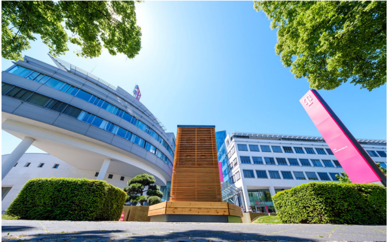
• City Tree Deutsche Telekom Bonn

Positioning is key; as Sanger notes: “Not all places where people live are polluted, and people aren’t everywhere there is pollution. Where the two meet, that’s where we place the trees.” Sanger would like to see his devices installed in the world’s most vehicle-polluted cities within the next decade.