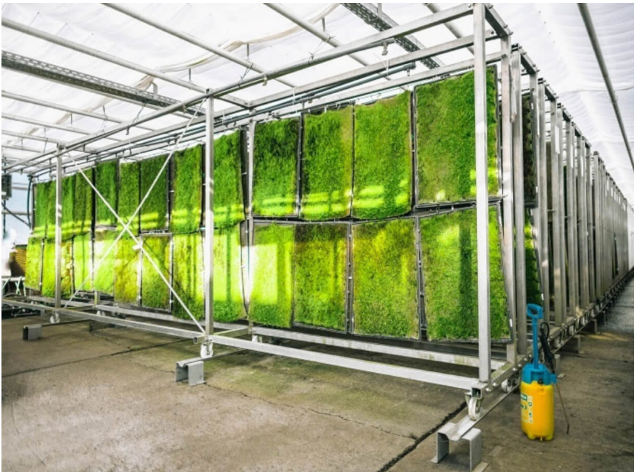
Mosses being grown

Moss is well adapted to the task of filtering polluted air, possessing the ability to bind fine dust and metabolise it. It can filter soot and particulates from the air breathed by 7,000 people every hour. In