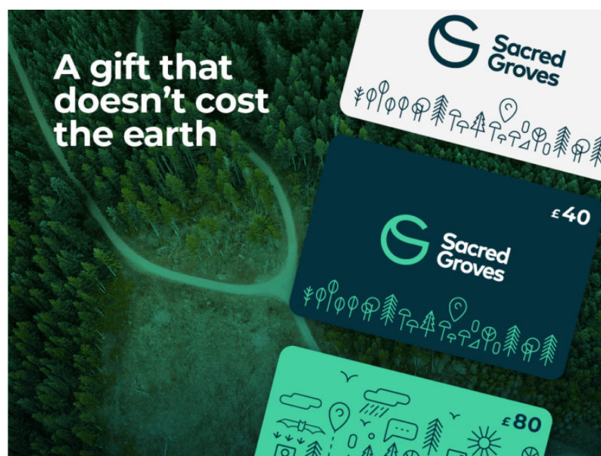
Sacred Groves Clusters as Gifts

Buying gifts can almost feel like a formality one needs to fulfill, but there are examples where people are finding alternative paths to navigate this situation.