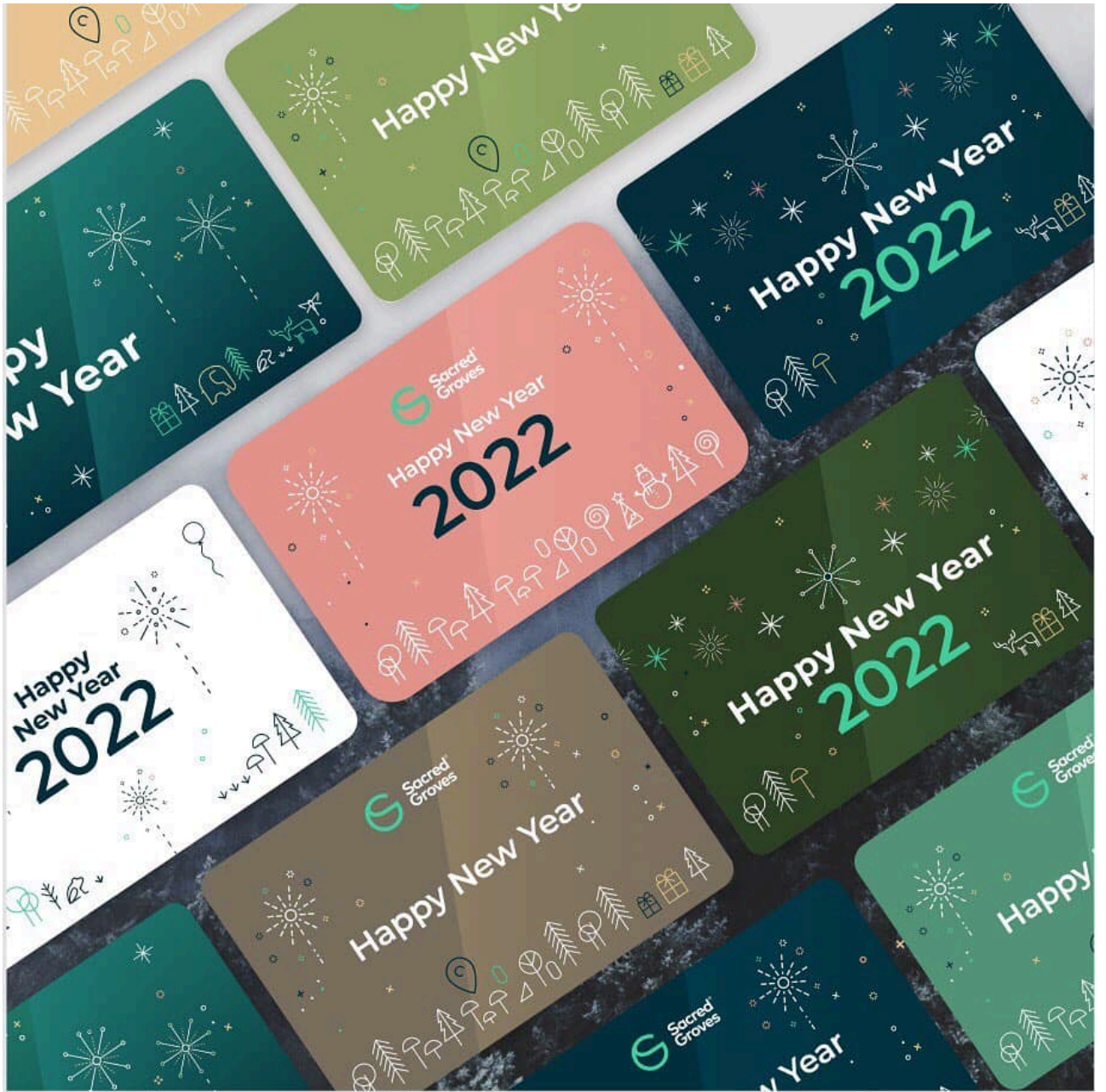
SGCs for New Year

Gift planet-positive this year by buying a Sacred Groves Cluster for friends and family.