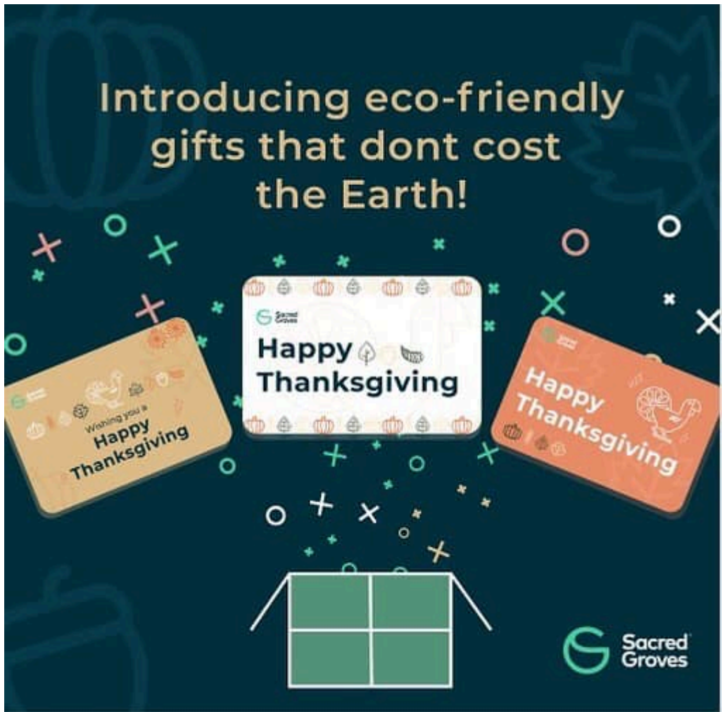
• SGCs for Thanksgiving